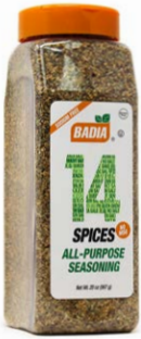
14 SPICES - 40554 4/20 OZ