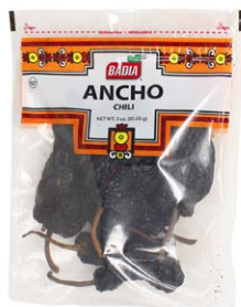
ANCHO - 00716 12/3 OZ

Browse our selection and find everything you need for a real Mexican meal.