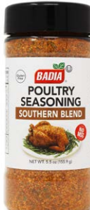
POULTRY SEASONING - 60746 6/5.5 OZ