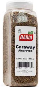
CARAWAY WHOLE - 00576 6/16 OZ