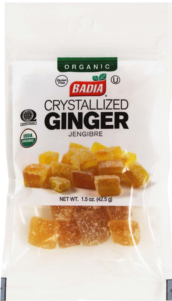
ORGANIC CRYSTALLIZED GINGER - 00083 12/1.5 OZ

From basic ingredients as Cinnamon and Cardamom "Queen of Spices" , to promoting a healthy lifestyle with our Trilogy Seeds. All your healthy and organic needs you'll find them here.