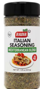
ITALIAN SEASONING - 60742 6/1.25 OZ