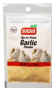
GARLIC POWDER - 00070 12/1 OZ