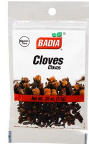
CLOVES - 00037 12/0.25 OZ