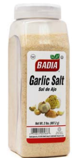
GARLIC SALT - 00586 6/2 LBS