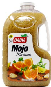
MOJO MARINADE - 00415 4/128 FL OZ