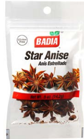
STAR ANISE - 00035 12/0.5 OZ