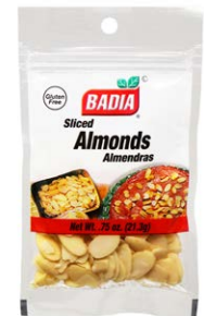
ALMONDS SLICED - 00036