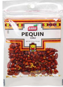
PEQUIN CHILI - 00654 12/0.5 OZ