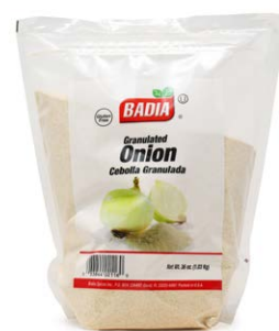
GRANULATED ONION - 02116 6/36 OZ