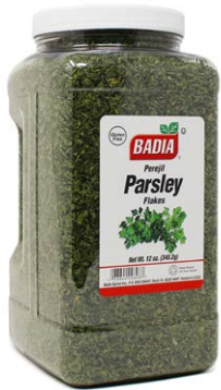
PARSLEY FLAKES - 00603 4/12 OZ