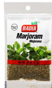
MARJORAM - 00057 12/0.25 OZ