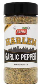
HARLEM GARLIC PEPPER - 60197 6/6 OZ