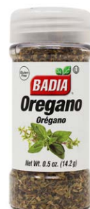
OREGANO WHOLE - 80009 8/2.5 OZ