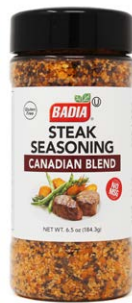
STEAK SEASONING - 60740 6/6.5 OZ