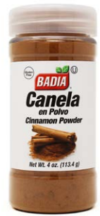
CINNAMON POWDER - 63003 6/4 OZ