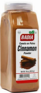
CINNAMON POWDER - 00511 6/16 OZ