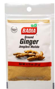
GINGER GROUND - 00075 12/0.75 OZ