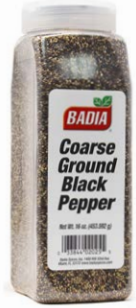
PEPPER BLACK COARSE GRIND - 02025 6/16 OZ