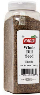
DILL SEED WHOLE - 00583 6/14 OZ