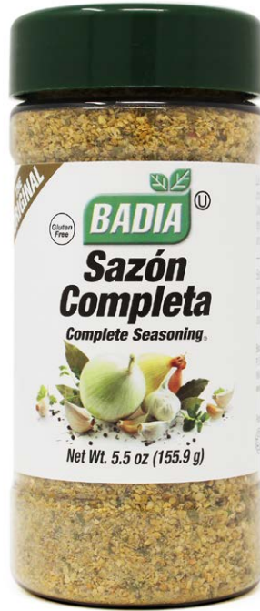
SAZÓN COMPLETA® - 63000 6/5.5 OZ