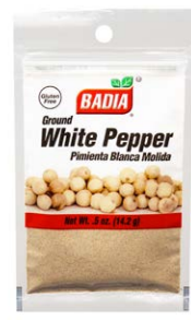
PEPPER GROUND WHITE - 00026 12/0.5 OZ