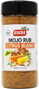
MOJO RUB - 60145 6/5 OZ