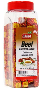
BEEF BOUILLON CUBES - 00598 6/32 OZ