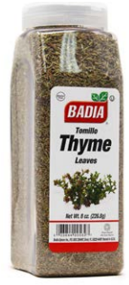
THYME LEAVES WHOLE - 00562 6/8 OZ