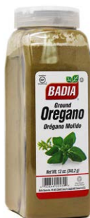
OREGANO GROUND - 00539 6/12 OZ