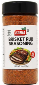
BRISKET RUB SEASONING - 60196 6/6 OZ