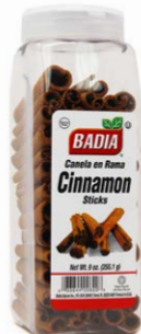
CINNAMON STICKS - 00622 6/9 OZ