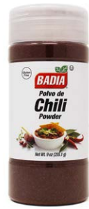
CHILI POWDER - 00214 12/9 OZ