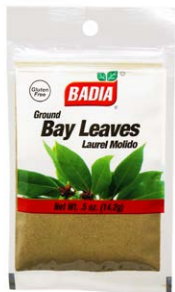
BAY LEAVES GROUND - 00020