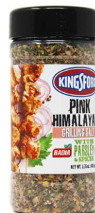
PINK & PARSLEY GRILLING SALT - 66005 6/5.75 OZ