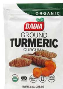
ORGANIC TURMERIC GROUND - 02129 8/8 OZ