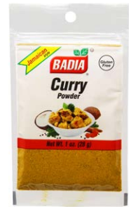
CURRY POWDER - 00074 12/1 OZ