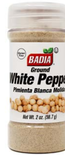
PEPPER GROUND WHITE - 80216 8/2 OZ