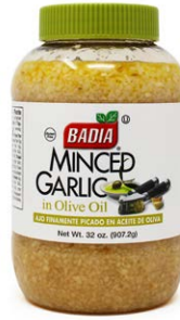
MINCED GARLIC IN OLIVE OIL - 00421 6/32 OZ