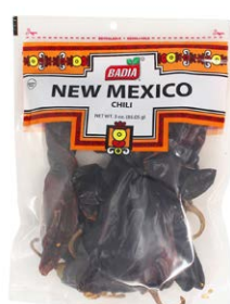
NEW MEXICO - 00640 12/3 OZ