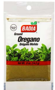
OREGANO GROUND - 00022 12/0.5 OZ