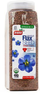
ORGANIC FLAX SEED WHOLE - 40518 4/22 OZ