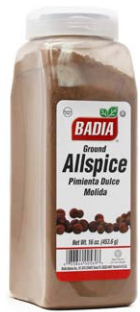
ALLSPICE GROUND - 00569 6/16 OZ