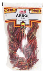
ARBOL - 00683 12/6 OZ