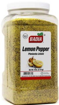
LEMON PEPPER SEASONING - 00764 4/6 LBS