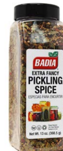
PICKLING SPICE (EXTRA FANCY) - 02033 6/13 OZ