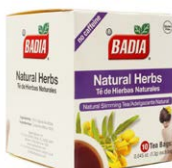
NATURAL HERBS - 00631 20/10 BAGS