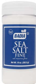
SEA SALT FINE - 60432 6/10 OZ