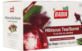
HIBISCUS - 00628 10/25 BAGS