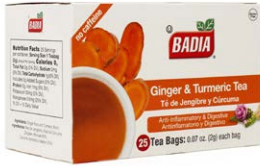
GINGER & TURMERIC - 00205 10/25 BAGS

Our Tea Bags are filled with great attributes to improve health and well-being. From immune boosters, antioxidants, organics, natural slimming, to anti-inflammatory; Badia has one for you.