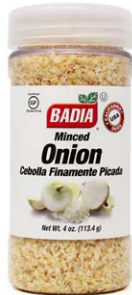
ONION MINCED - 60193 6/4 OZ