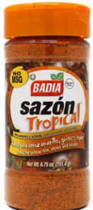
SAZÓN TROPICAL® WITH CORIANDER & ANNATTO - 60735 6/6.75 OZ