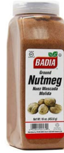
NUTMEG GROUND - 00534 6/16 OZ