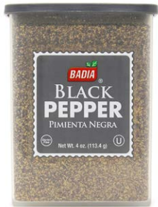
BLACK PEPPER - 00407 12/4 OZ

Conveniently spice up your favorite dishes with our cans & grinders!