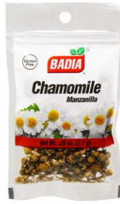
CHAMOMILE FLOWERS - 00034 12/0.25 OZ