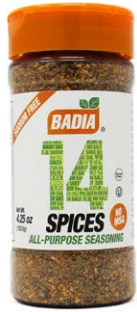
14 SPICES - 60150 6/4.25 OZ