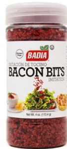
BACON BITS IMITATION - 60412 6/4 OZ