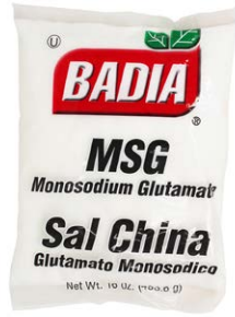
M.S.G. - 00500 6/1.75 LBS