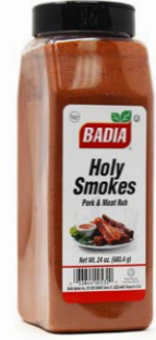
HOLY SMOKES - 00532 6/24 OZ