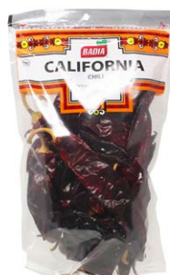
CALIFORNIA - 00684 12/6 OZ