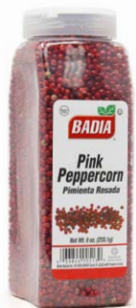
PEPPER PINK WHOLE - 00513 6/9 OZ