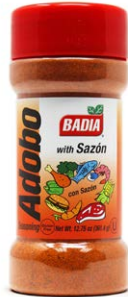
ADOBO CON SAZÓN - 00379 12/12.75 OZ