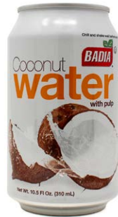
COCONUT WATER - 12240 12/10.5 OZ

Use as a beverage or as an ingredient for an incredible curry, puddings, cakes, flans, sauces and all your favorite dishes!