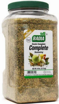
COMPLETE SEASONING® - 00310 4/6 LBS

These jars are filled with the ideal amount to enjoy our favorites, from basics in the kitchen to our proprietary blends.