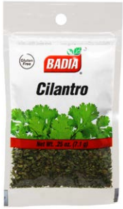
CILANTRO - 00061 12/0.25 OZ