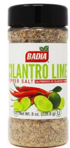
CILANTRO LIME PEPPER SALT - 60186