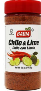
CHILE & LIME - 60156 6/6.5 OZ