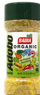
ADOBO ORGANIC - 01259