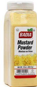
MUSTARD DRY - 00590 6/16 OZ