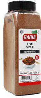
FIVE SPICE BLEND - 00806 6/16 OZ