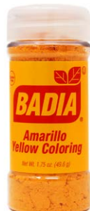
YELLOW COLORING - 80669 8/1.75 OZ