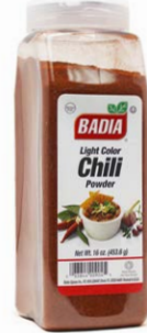
CHILI POWDER LIGHT COLOR - 00904 6/16 OZ