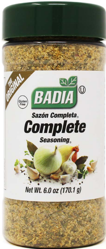
COMPLETE SEASONING® - 60135

Every blend is created with a perfect balance of flavor and with the highest quality spices and herbs.