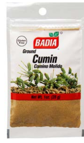
CUMIN GROUND - 00017 12/1 OZ