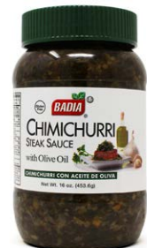
CHIMICHURRI SAUCE - 00936 12/16 FL OZ