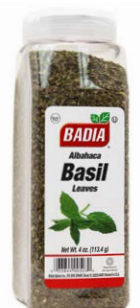
BASIL - 00503 6/4 OZ