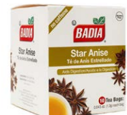
STAR ANISE - 00629 20/10 BAGS