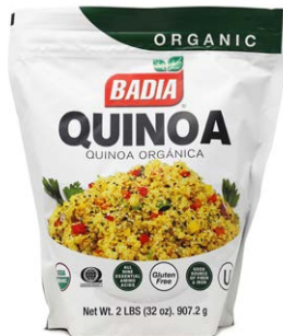
ORGANIC QUINOA - 00094 6/2 LBS