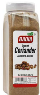
CORIANDER GROUND - 00668 6/14 OZ