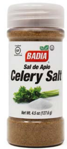
CELERY SALT - 80229 8/4.5 OZ