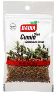
CUMIN SEED - 00018 12/1 OZ