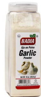
GARLIC POWDER - 00680 6/16 OZ