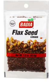
FLAX SEED - 00060 12/1.5 OZ