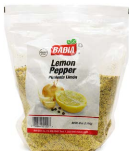
LEMON PEPPER - 02120 6/40 OZ