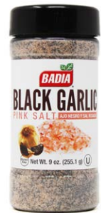
BLACK GARLIC PINK SALT - 60188