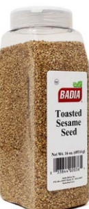
SESAME SEED TOASTED WHITE - 02036 6/16 OZ