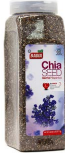
CHIA SEED - 40507 4/22 OZ