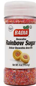
RAINBOW SUGAR - 80269 8/4 OZ