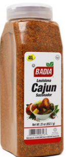
CAJUN SEASONING - 00616 6/23 OZ