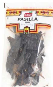
PASILLA (NEGRO LARGO) - 00685 12/6 OZ