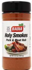
HOLY SMOKES - 60392 6/5.5 OZ