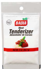
MEAT TENDERIZER - 00071 12/2 OZ