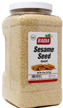
SESAME SEED HULLED - 00799 4/5 LBS