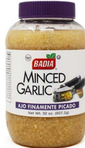
MINCED GARLIC IN WATER - 00345 6/32 OZ