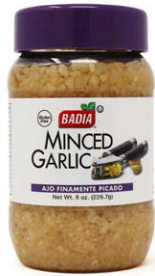
MINCED GARLIC IN WATER - 00335 12/8 OZ