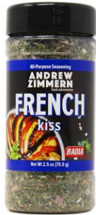
FRENCH KISS - 61302 6/2.5 OZ

Transform your everyday cooking with these all-purpose blends that capture the essence of Andrew's favorite cuisines around the world.