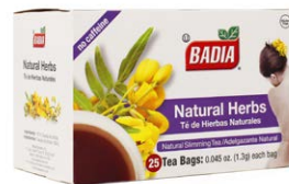
NATURAL HERBS - 00792 10/25 BAGS