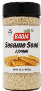
SESAME SEED - 60141 6/4.5 OZ