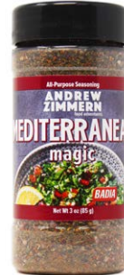
MEDITERRANEAN MAGIC - 61306 6/3 OZ