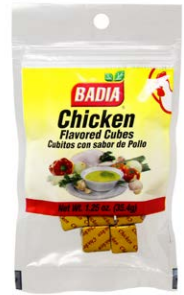
CHICKEN FLAVORED CUBES - 00077 12/1.25 OZ