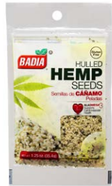
HULLED HEMP SEEDS - 00081 12/1.25 OZ