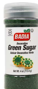
GREEN SUGAR - 80267 8/4 OZ