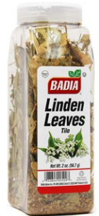
LINDEN LEAVES - 00502 6/2 OZ