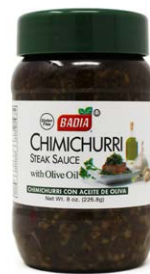
CHIMICHURRI SAUCE - 00405 12/8 FL OZ