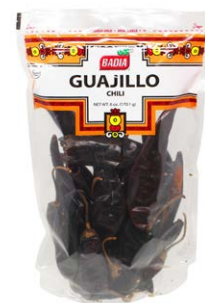
GUAJILLO CHILE - 00682 12/6 OZ