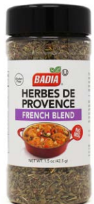
HERBS DE PROVENCE - 60741 6/1.5 OZ