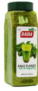
KALE FLAKES - 40183 4/18 OZ