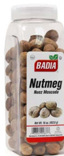
NUTMEG WHOLE - 00837 6/16 OZ