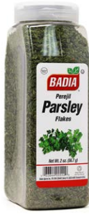
PARSLEY FLAKES - 00542 6/2 OZ