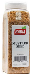
MUSTARD SEED - 00991 6/24 OZ