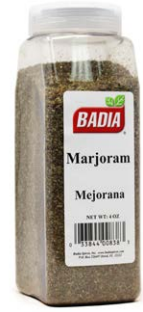
MARJORAM WHOLE - 00838 6/4 OZ