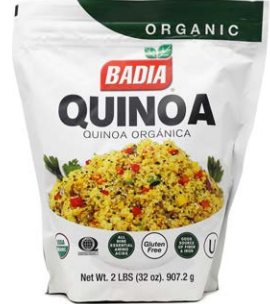
ORGANIC QUINOA - 00094 6/2 LBS