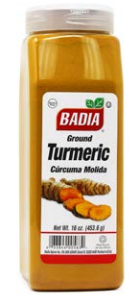
TURMERIC GROUND - 00563 6/16 OZ