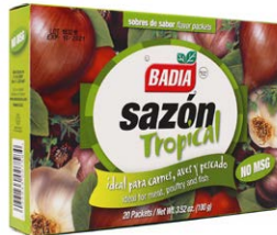
SAZON TROPICAL® - 00758 15/3.52 OZ