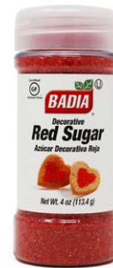
RED SUGAR - 80268 8/4 OZ