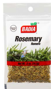
ROSEMARY - 00058 12/0.5 OZ