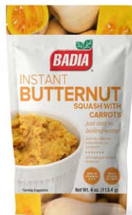
INSTANT BUTTERNUT SQUASH WITH CARROTS - 01262 6/4 OZ