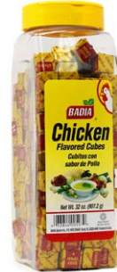
CHICKEN BOUILLON CUBES - 00597 6/32 OZ