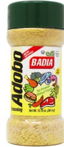
ADOBO WITHOUT PEPPER - 01205 12/12.75 OZ