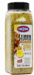
LEMON PEPPER - 46007 4/1.5 LBS