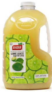
LIME JUICE - 00411 4/128 FL OZ