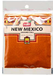
NEW MEXICO GROUND - 00648 12/1.5 OZ