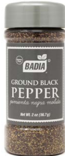
PEPPER GROUND BLACK - 80448 8/2 OZ