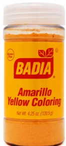
YELLOW COLORING - 60406 6/4.25 OZ