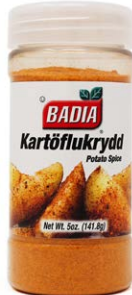
KARTÖFLUKRYDD - 60110 6/5 OZ