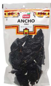
ANCHO - 00707 12/6 OZ