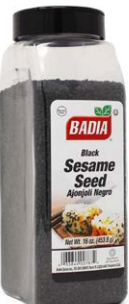
SESAME SEED BLACK - 00787 6/16 OZ