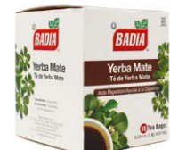
YERBA MATE - 00768 20/10 BAGS