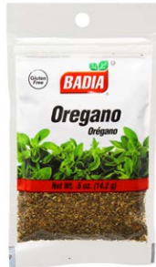
OREGANO WHOLE - 00021 12/0.5 OZ