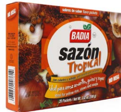
SAZON TROPICAL® WITH CORIANDER & ANNATTO - 00761 15/3.52 OZ