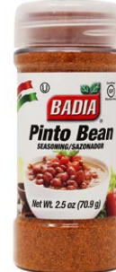
PINTO BEAN SEASONING - 80133 8/2.5 OZ