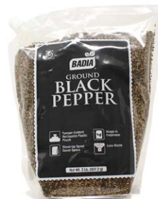
COARSE GRIND BLACK PEPPER - 02016 8/2 LBS