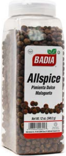
ALLSPICE WHOLE - 00601 6/12 OZ