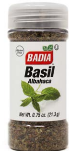
BASIL - 80215 8/0.75 OZ