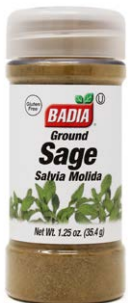
SAGE GROUND - 80675 8/1.25 OZ