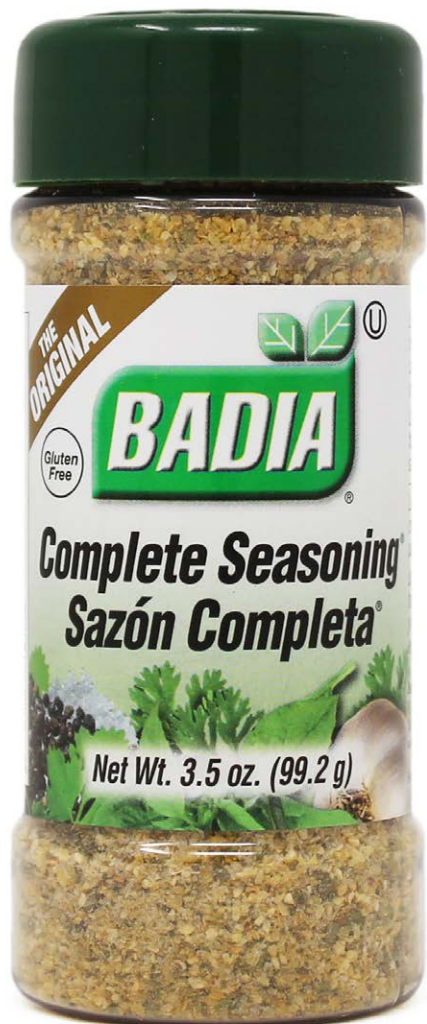
COMPLETE SEASONING® - 80008