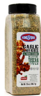
GARLIC & HERBS - 46009 4/25 OZ