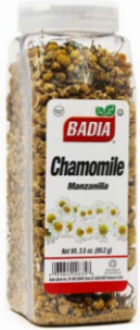
CHAMOMILE FLOWER - 00635 6/3.5 OZ