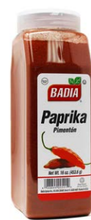
PAPRIKA - 00541 6/16 OZ