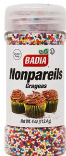
NONPAREILS - 80207 8/4 OZ