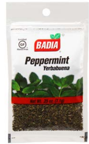
PEPPERMINT - 00059 12/0.25 OZ