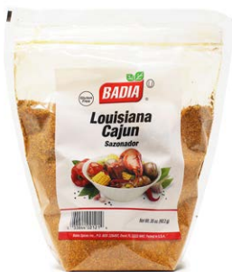
CAJUN SEASONING - 02121 6/35 OZ