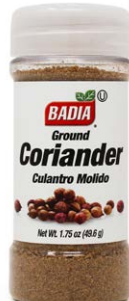
CORIANDER GROUND - 80203 8/1.75 OZ