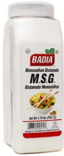
M.S.G. - 00531 6/1.75 LBS