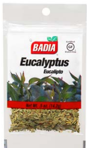
EUCALYPTUS - 00062 12/0.5 OZ