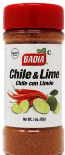
CHILE & LIME - 80154 8/3 OZ