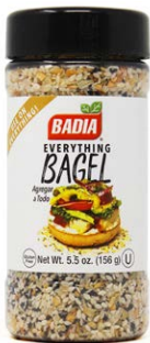
EVERYTHING BAGEL - 60096 6/5.5 OZ