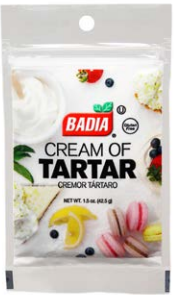
CREAM OF TARTAR - 00088 12/1.5 OZ