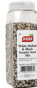
SESAME SEED 50/50 MIX - 02027 6/16 OZ