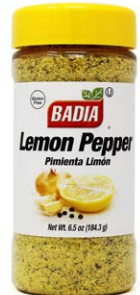
LEMON PEPPER - 60670 6/6.5 OZ