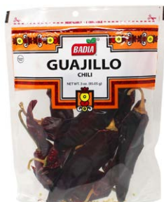
GUAJILLO - 00643 12/3 OZ