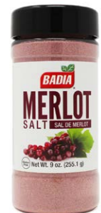
MERLOT SALT - 60155