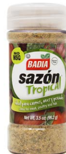
SAZÓN TROPICAL® - 80130 8/3.5 OZ

A PERCENTAGE OF SALES GOES TO THE NATIONAL BREAST CANCER FOUNDATION (NBCF).