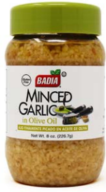
MINCED GARLIC IN OLIVE OIL - 00220 12/8 OZ