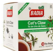
CAT'S CLAW - 00712 20/10 BAGS