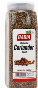
CORIANDER SEED - 00580 6/12 OZ