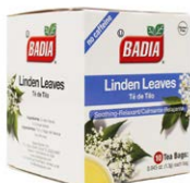
LINDEN LEAVES - 00211 20/10 BAGS