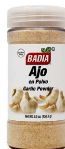
GARLIC POWDER - 63001 6/5.5 OZ