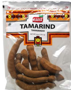
TAMARIND - 00661 12/6 OZ