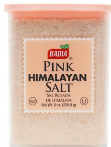
PINK HIMALAYAN SALT - 00399 12/8 OZ