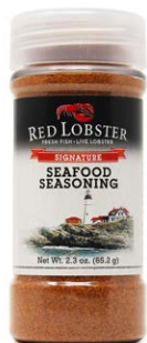
RED LOBSTER SEASONING - 00093 12/2.3 OZ

Take home the unique flavors of your favorite restaurants!