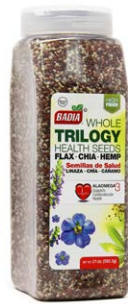
TRILOGY HEALTH SEEDS - 40525 4/21 OZ