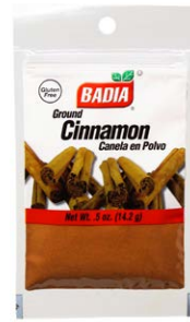
CINNAMON POWDER - 00030 12/0.5 OZ