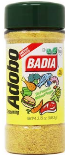
ADOBO WITHOUT PEPPER - 00132 12/3.75 OZ