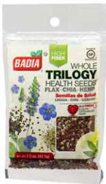
TRILOGY HEALTH SEEDS - 00080 12/1.5 OZ