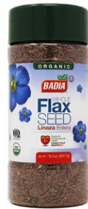
ORGANIC FLAX SEED WHOLE - 00121 12/10.5 OZ