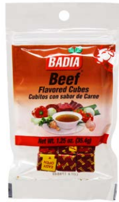
BEEF FLAVORED CUBES - 00078 12/1.25 OZ