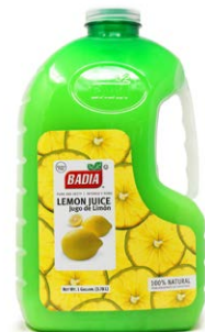
LEMON JUICE - 00408 4/128 FL OZ