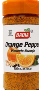
ORANGE PEPPER - 60194 6/6.5 OZ