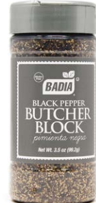
PEPPER BLACK BUTCHER BLOCK - 60495 6/3.5 OZ