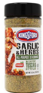
GARLIC & HERBS - 66004 6/5.5 OZ