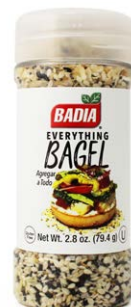
EVERYTHING BAGEL - 01244 8/2.8 OZ