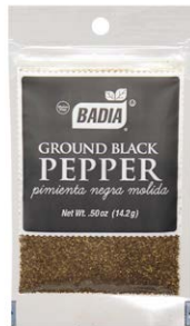
PEPPER GROUND BLACK - 00024 12/0.5 OZ