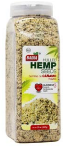
HULLED HEMP SEEDS - 40526 4/20 OZ