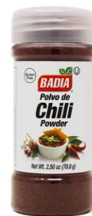
CHILI POWDER - 80201 8/2.5 OZ