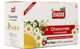
CHAMOMILE - 00790 10/25 BAGS