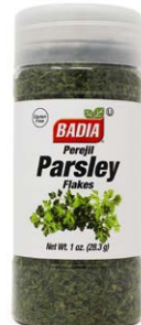
PARSLEY FLAKES - 00104 12/1 OZ