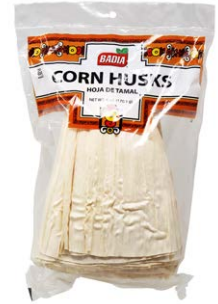
CORN HUSKS - 00645 12/6 OZ