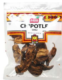
CHIPOTLE - 00703 12/3 OZ