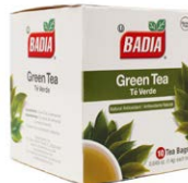
GREEN TEA - 00710 20/10 BAGS