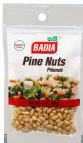
PINE NUTS - 00068 12/1 OZ