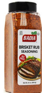
BRISKET RUB SEASONING - 40552 4/24 OZ