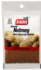
NUTMEG GROUND - 00032 12/0.5 OZ