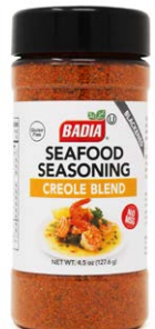
SEAFOOD SEASONING - 60744 6/4.5 OZ