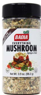
EVERYTHING MUSHROOM - 61227 6/3.5 OZ