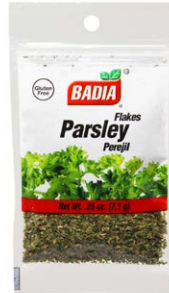
PARSLEY FLAKES - 00041 12/0.25 OZ