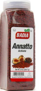
ANNATTO WHOLE - 00505 6/22 OZ