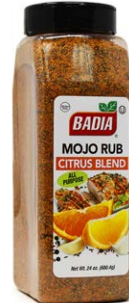
MOJO RUB - 40146 4/24 OZ