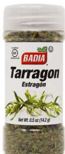
TARRAGON - 80677 8/0.5 OZ