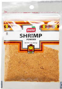
SHRIMP POWDER - 00286 12/1 OZ