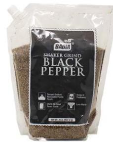
GROUND BLACK PEPPER - 02015 8/2 LBS