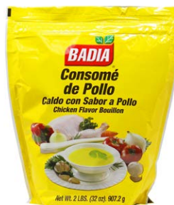
CHICKEN FLAVOR BOUILLON - 00934 8/2 LBS