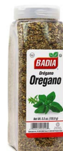
OREGANO WHOLE - 00540 6/5.5 OZ