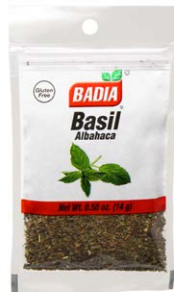
BASIL - 00072