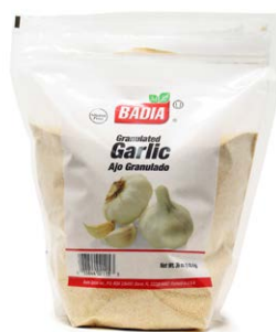
GRANULATED GARLIC - 02115 6/36 OZ