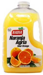
SOUR ORANGE - 00739 4/128 FL OZ