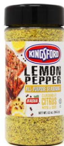
LEMON PEPPER - 66002 6/6.5 OZ