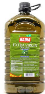
EXTRA VIRGIN OLIVE OIL - 00427 3/5 LITER