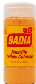
YELLOW COLORING - 00714 12/9.5 OZ