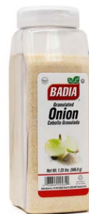
ONION GRANULATED - 00535 6/1.25 LBS