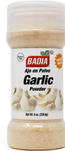
GARLIC POWDER - 01200 12/8 OZ