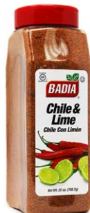
CHILE & LIME - 40544 4/25 OZ

The one that started it all, has the perfect combination of ingredients and spices, carefully chosen to enhance the natural flavor of your favorite food.