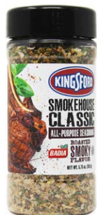
SMOKEHOUSE CLASSIC - 66007 6/5.75 OZ