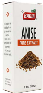
ANISE EXTRACT - 00417 12/2 OZ