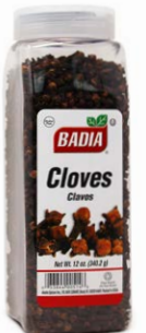
CLOVES WHOLE - 00514 6/12 OZ