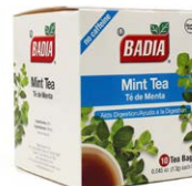
MINT - 00624 20/10 BAGS