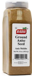
ANISE SEED GROUND - 00571 6/16 OZ