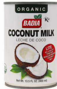
ORGANIC COCONUT MILK LITE - 00556 12/13.5 OZ