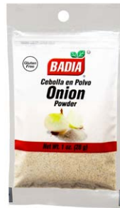
ONION POWDER - 00073 12/1 OZ