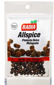
ALLSPICE WHOLE - 00040

The one that started it all, has the perfect combination of ingredients and spices, carefully chosen to enhance the natural flavor of your favorite food.