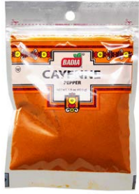
CAYENNE GROUND - 00280 12/1.5 OZ