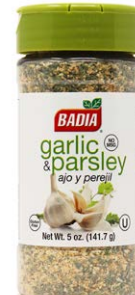
GARLIC & PARSLEY - 60403 6/5 OZ