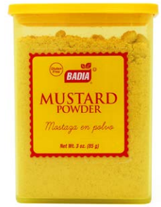
MUSTARD POWDER - 00262 12/3 OZ