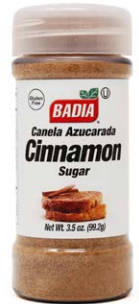
CINNAMON SUGAR - 80202 8/3.5 OZ