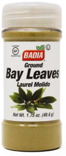
BAY LEAVES GROUND - 80013 8/1.75 OZ