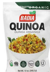
ORGANIC QUINOA - 00175 6/12 OZ