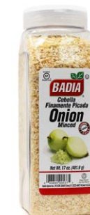
ONION MINCED - 00537 6/17 OZ