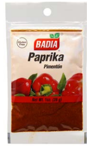
PAPRIKA - 00027 12/1 OZ