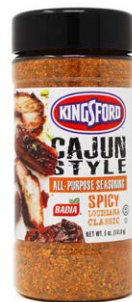
CAJUN STYLE - 66003 6/5 OZ