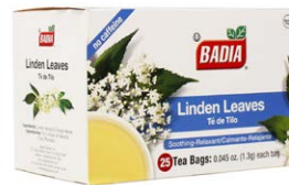
LINDEN LEAVES - 00791 10/25 BAGS