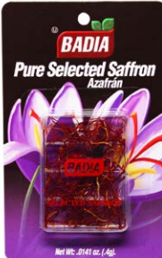
SAFFRON SPANISH - 00055 12/0.4 GM