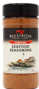
RED LOBSTER SEASONING - 60290 6/5 OZ