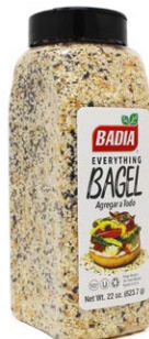
EVERYTHING BAGEL - 40800 4/22 OZ