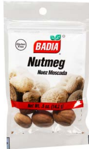
NUTMEG WHOLE - 00031 12/0.5 OZ