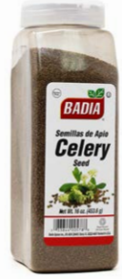
CELERY SEED WHOLE - 00578 6/16 OZ