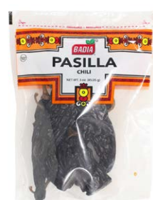
PASILLA (NEGRO LARGO) - 00066 12/3 OZ