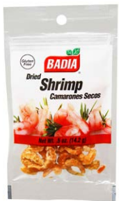
SHRIMP DRIED - 00038 12/0.5 OZ