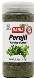
PARSLEY FLAKES - 63010 6/0.5 OZ