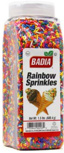
RAINBOW SPRINKLES - 00293 6/1.5 LBS