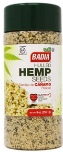
HULLED HEMP SEEDS - 00124 12/9 OZ