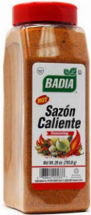
SAZÓN CALIENTE - 00533 6/28 OZ