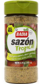
SAZÓN TROPICAL® - 60757 6/6.75 OZ