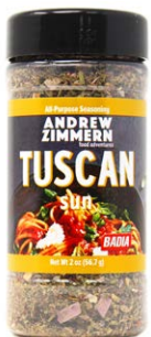
TUSCAN SUN - 61305 6/2 OZ