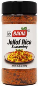
JOLLOF RICE SEASONING - 60199 6/5.75 OZ