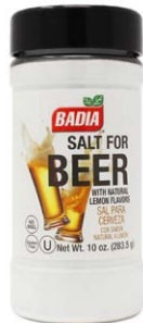
SALT FOR BEER - 60098 6/10 OZ