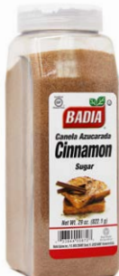
CINNAMON SUGAR - 00872 6/29 OZ