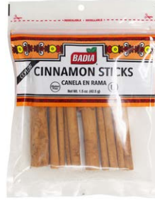
CINNAMON STICKS - 00690 12/1.5 OZ