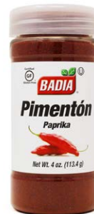
PAPRIKA - 63005 6/4 OZ