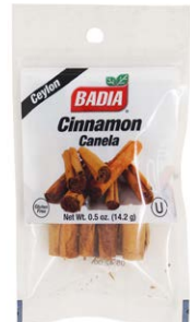
CINNAMON STICKS - 00029 12/0.5 OZ