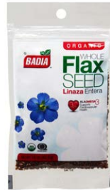
ORGANIC FLAX SEED WHOLE - 00053 12/1.5 OZ