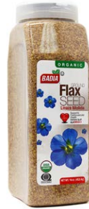
ORGANIC FLAX SEED GROUND - 40510 4/16 OZ