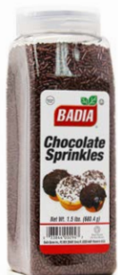
CHOCOLATE SPRINKLES - 00294 6/24 OZ