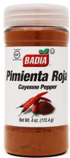
CAYENNE PEPPER - 63006 6/4 OZ