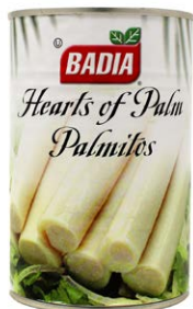
HEARTS OF PALM CAN - 00449 12/14 OZ