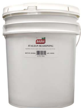
ITALIAN SEASONING - 00815 10 LBS