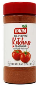
KETCHUP SEASONING - 60143 6/6 OZ