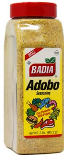
ADOBO WITH PEPPER - 00549 6/2 LBS