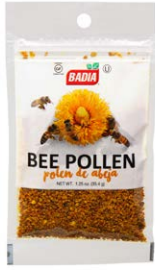
BEE POLLEN - 00082 12/1.25 OZ