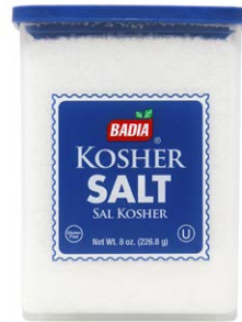
KOSHER SALT - 00398 12/8 OZ