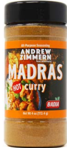
MADRAS HOT CURRY - 61303 6/4 OZ