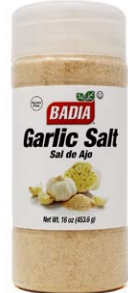
GARLIC SALT - 00114 12/16 OZ