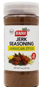
JERK SEASONING - 60756 6/5 OZ