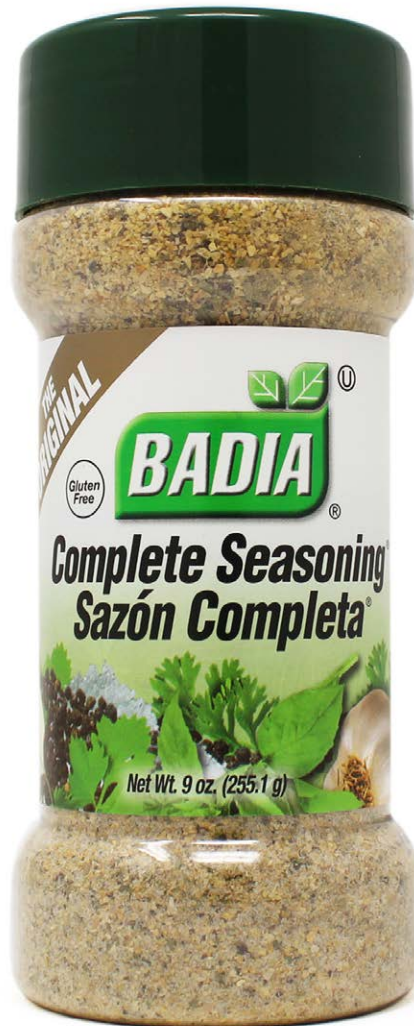
COMPLETE SEASONING® - 01201 12/9 OZ

Our Value Pack bottles have all the flavor of our signature blends, and new and exciting items that will become a must in your kitchen.