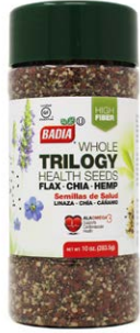
TRILOGY HEALTH SEEDS - 00123 12/10 OZ