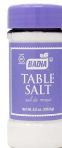
TABLE SALT - 80144 8/5.5 OZ