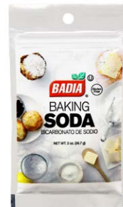
BAKING SODA - 00087