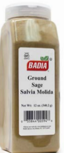
SAGE GROUND - 00594 6/12 OZ