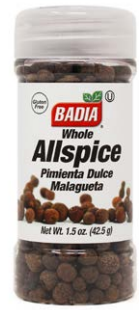
ALLSPICE WHOLE - 80227 8/1.5 OZ