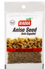
ANISE SEED - 00028