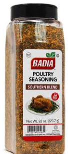
POULTRY SEASONING - 00593 6/22 OZ