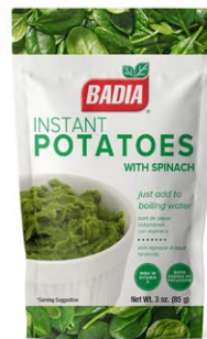
INSTANT POTATOES WITH SPINACH - 01266 6/3 OZ