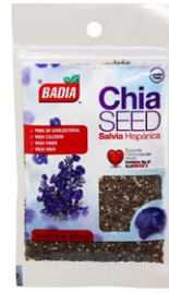
CHIA SEED - 00045 12/1.5 OZ