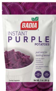
INSTANT PURPLE POTATOES - 01265 6/3 OZ