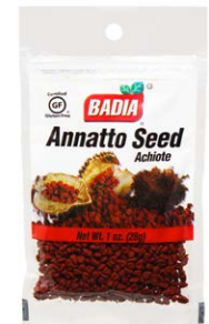
ANNATTO SEED - 00023