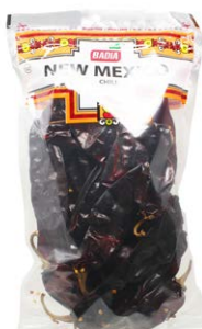
NEW MEXICO - 00686 12/6 OZ