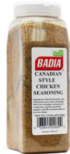
CHICKEN SEASONING (CANADIAN)-02030 6/23 OZ