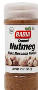
NUTMEG GROUND - 80217 8/2 OZ