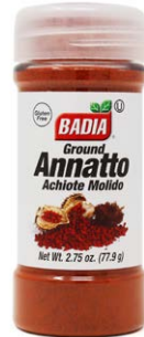
ANNATTO GROUND - 80012 8/2.75 OZ