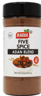
FIVE SPICE - 60747 6/4 OZ