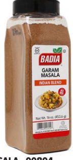
GARAM MASALA - 00804 6/16 OZ