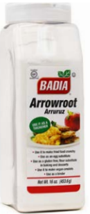
ARROWROOT - 40573 4/16 OZ