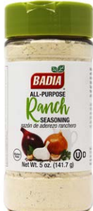
RANCH SEASONING - 61226 6/5 OZ