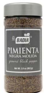
PEPPER BLACK GROUND - 63002 6/3.5 OZ