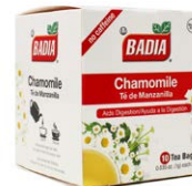
CHAMOMILE - 00210 20/10 BAGS