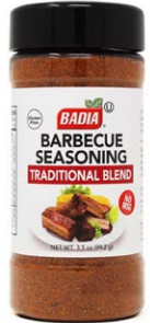
BARBECUE SEASONING - 60745 6/3.5 OZ