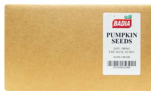
PUMPKIN SEEDS - 02086 1/10 LBS