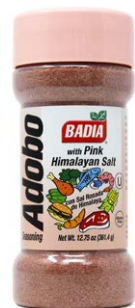
ADOBO WITH PINK HIMALAYAN SALT - 01225