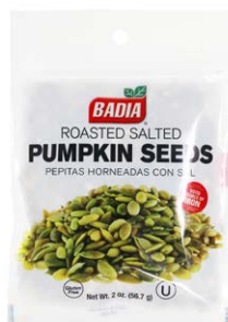
ROASTED SALTED PUMPKIN SEEDS-00738 12/2 OZ