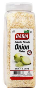
ONION FLAKES - 00536 6/14 OZ