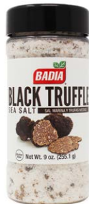
BLACK TRUFFLE SEA SALT - 60559