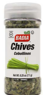
CHIVES - 80679 8/0.25 OZ