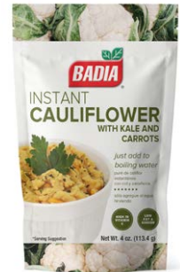
INSTANT CAULIFLOWER WITH KALE & CARROTS - 01264 6/4 OZ