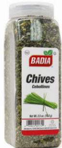
CHIVES DEHYDRATED - 00174 6/1 OZ