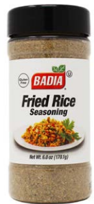
FRIED RICE SEASONING - 60198 6/6 OZ