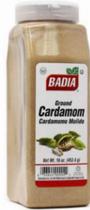
CARDAMOM GROUND - 00992 6/16 OZ