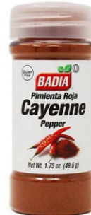
PEPPER GROUND CAYENNE - 80224 8/1.75 OZ