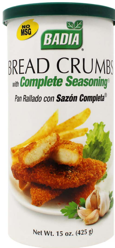
BREAD CRUMBS - 00270 12/15 OZ

A fine selection of key products to create delightful dishes for every occasion.