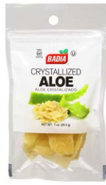
CRYSTALLIZED ALOE - 00086 12/1 OZ