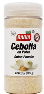
ONION POWDER - 63008 6/5 OZ