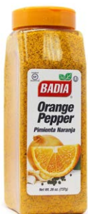
ORANGE PEPPER - 40530 4/26 OZ