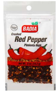
PEPPER CRUSHED RED - 00039 12/0.5 OZ