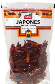
JAPONÉS (RED CHILI PEPPER) - 00681 12/6 OZ