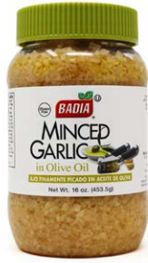
MINCED GARLIC IN OLIVE OIL - 00737 12/16 OZ