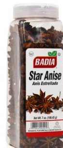
STAR ANISE - 00501 6/7 OZ