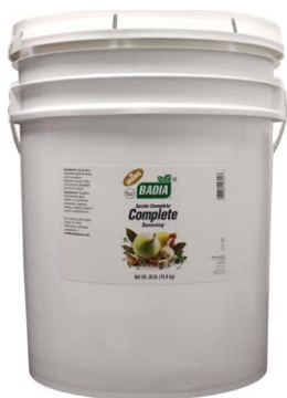
COMPLETE SEASONING® - 00702 35 LBS

Enjoy our favorites in a convenient size for your food preparations, from basics in the kitchen to our proprietary blends.