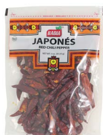
JAPONÉS (RED CHILI PEPPER) - 00067 12/3 OZ