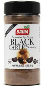
BLACK GARLIC SEASONING - 60653

The one that started it all, has the perfect combination of ingredients and spices, carefully chosen to enhance the natural flavor of your favorite food.