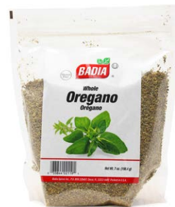
WHOLE OREGANO - 02119 6/7 OZ