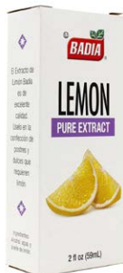
LEMON EXTRACT - 00419 12/2 OZ