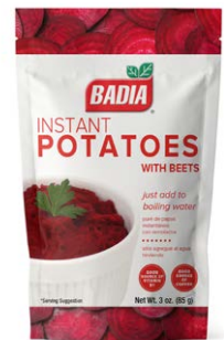
INSTANT POTATOES WITH BEETS - 01263 6/3 OZ