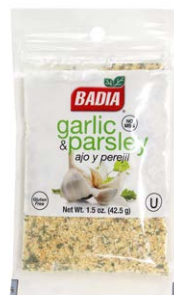
GARLIC & PARSLEY - 00076 12/1.5 OZ