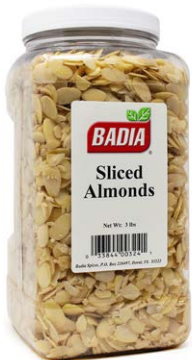
ALMONDS SLICED & BLANCHED - 00324 4/3 LBS