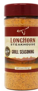
LONGHORN SEASONING - 60291 6/6 OZ