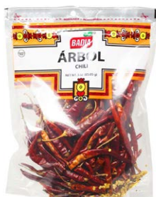
ARBOL - 00641 12/3 OZ