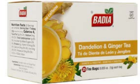
DANDELION & GINGER - 00238 10/25 BAGS