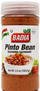
PINTO BEAN SEASONING - 60754 6/5.5 OZ