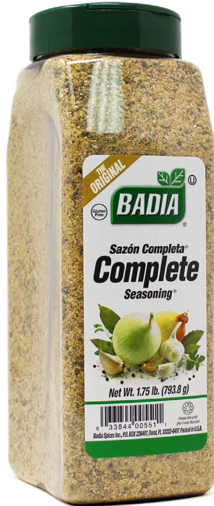
COMPLETE SEASONING® - 00551 6/1.75 LBS

These jars are filled with the ideal amount to enjoy our favorites, from basics in the kitchen to our proprietary blends.