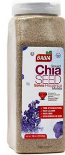
GROUND CHIA SEED - 40515 4/16 OZ