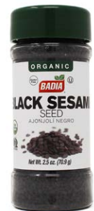
BLACK SESAME SEED - 80259 8/2.5 OZ