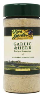
OLIVE GARDEN SEASONING - 60292 6/4.5 OZ