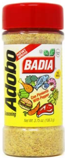
ADOBO WITH PEPPER - 00131 12/3.75 OZ