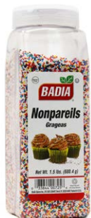
NONPAREILS - 00725 6/1.5 LBS