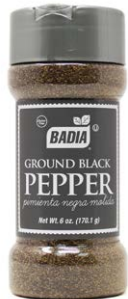
GROUND BLACK PEPPER - 01231 12/6 OZ