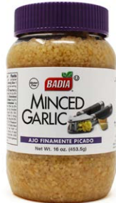
MINCED GARLIC IN WATER - 00340 12/16 OZ