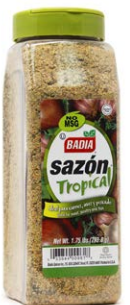
SAZÓN TROPICAL® - 00961 6/1.75 LBS