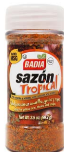
SAZÓN TROPICAL® WITH CORIANDER & ANNATTO - 80129 8/3.5 OZ