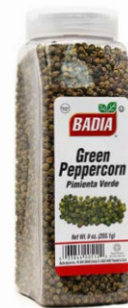
PEPPER GREEN WHOLE - 00512 6/16 OZ