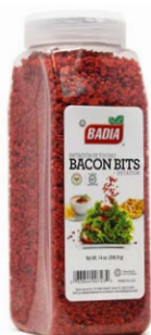
BACON BITS IMITATION - 00723 6/14 OZ