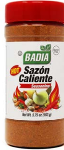
SAZÓN CALIENTE - 60393 6/5.75 OZ