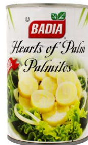
HEARTS OF PALM SLICED - 00453 12/15 OZ