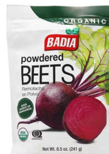
ORGANIC RED BEET - 02126 8/8.5 OZ