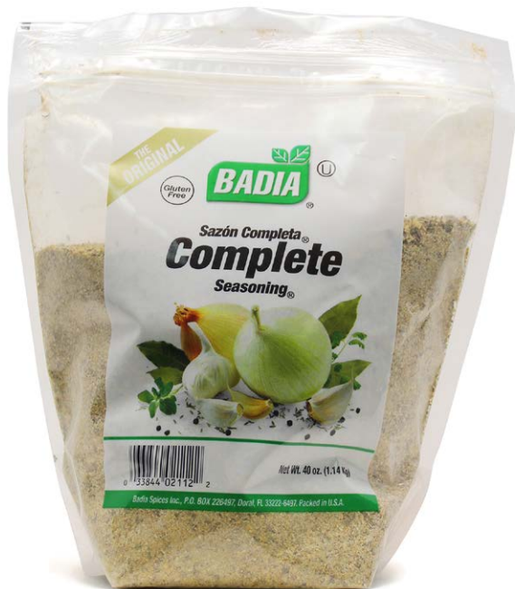
COMPLETE SEASONING® - 02112 6/40 OZ

Below you'll find a fine selection of key ingredients for your food preparations.