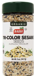
ORGANIC SESAME SEEDS TRI-COLOR - 60148 6/5 OZ