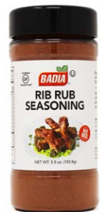
RIB RUB SEASONING - 60195 6/5.5 OZ