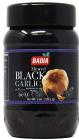
MINCED BLACK GARLIC IN WATER - 61221 6/8 OZ