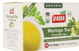
ORGANIC MORINGA WITH LEMON-00239 10/25 BAGS