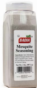
MESQUITE SEASONING - 00990 6/2 LBS