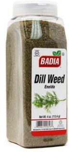
DILL WEED - 00626 6/4 OZ