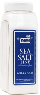
SALT SEA FINE - 00839 6/40 OZ