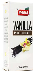
VANILLA EXTRACT - 00016 12/2 OZ