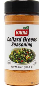
COLLARD GREENS - 60557 6/6 OZ