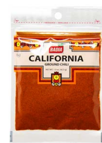
CALIFORNIA GROUND - 00647 12/1.5 OZ