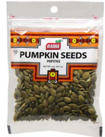
PUMPKIN SEED (PEPITAS) - 00656 12/2 OZ