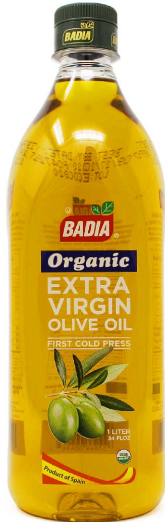
EXTRA VIRGIN OLIVE OIL - 40496 4/1 LITER