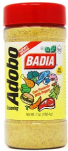
ADOBO WITH PEPPER - 60402 6/7 OZ