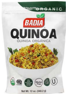
ORGANIC QUINOA - 00175 6/12 OZ

Complement your everyday meals with these beautiful and delicious side dishes.