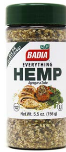
EVERYTHING HEMP - 60751 6/5.5 OZ