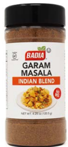
GARAM MASALA - 60743 6/4.25 OZ