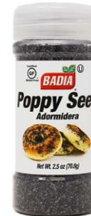
POPPY SEED - 80676 8/2.5 OZ