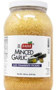
MINCED GARLIC IN WATER - 00348 4/128 OZ