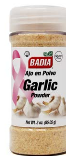
GARLIC POWDER - 80005 8/3 OZ