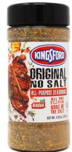
ORIGINAL NO SALT - 66000 6/4.25 OZ