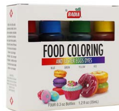
FOOD COLORING - 00422 12/1.2 OZ