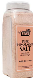
SALT PINK HIMALAYAN - 00538 6/40 OZ