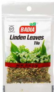
LINDEN LEAVES - 00033 12/0.25 OZ