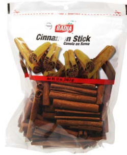
CINNAMON STICKS BAG - 60302 6/12 OZ