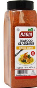
SEAFOOD SEASONING CREOLE BLEND - 00805 6/1.5 LBS