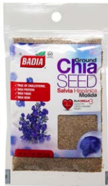
GROUND CHIA SEED - 00084 12/1 OZ