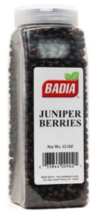
JUNIPER BERRIES - 00902 6/12 OZ