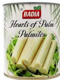
HEARTS OF PALM CAN - 00450 12/28 OZ