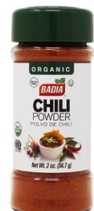
CHILI POWDER - 80171 8/2 OZ