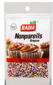
NONPAREILS - 00042 12/1 OZ