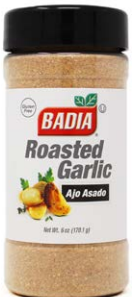
ROASTED GARLIC - 60390 6/5.5 OZ