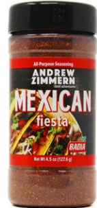
MEXICAN FIESTA - 61300 6/4.5 OZ