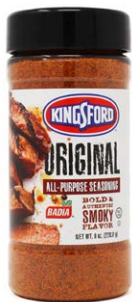
ORIGINAL - 66001 6/8 OZ