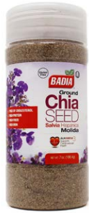
GROUND CHIA SEED - 00118 12/7 OZ