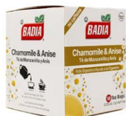
CHAMOMILE & ANISE - 00225 20/10 BAGS