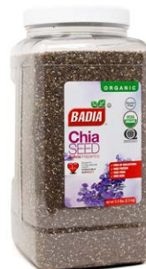
CHIA SEED - 20519 2/5.5 LBS