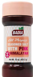
SEASONED SALT WITH PINK HIMALAYAN - 01220 12/15 OZ