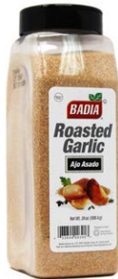
ROASTED GARLIC - 00391 6/24 OZ