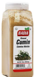
CUMIN SEED GROUND - 00516 6/16 OZ