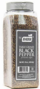
PEPPER BLACK TABLE GRIND - 00729 6/16 OZ