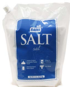
SALT - 00521 8/5 LBS