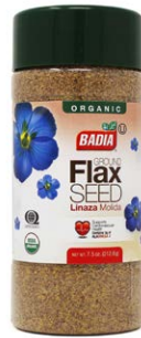
ORGANIC FLAX SEED GROUND - 00122 12/7.5 OZ