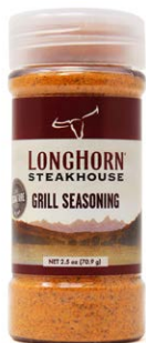
LONGHORN SEASONING - 00755 12/2.5 OZ