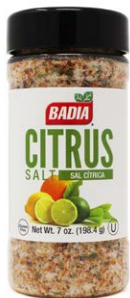
CITRUS SALT - 60184