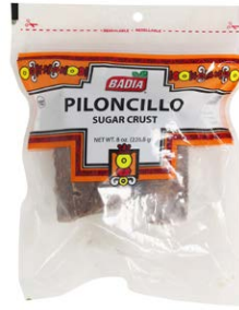
PILONCILLO (SUGAR CRUST) - 00665 12/8 OZ