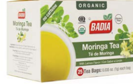
ORGANIC MORINGA WITH LEMON-00239 10/25 BAGS