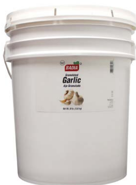
GARLIC GRANULATED - 00651 30 LBS