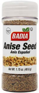
ANISE SEED - 80222 8/1.75 OZ