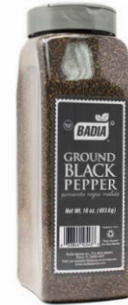
PEPPER BLACK GROUND - 10543 6/16 OZ