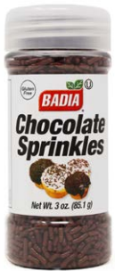
CHOCOLATE SPRINKLES - 80177 8/3 OZ