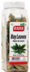
BAY LEAVES WHOLE - 00504 6/1.5 OZ