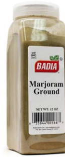
MARJORAM GROUND - 00588 6/12 OZ