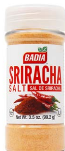
SRIRACHA SALT - 01246 12/3.5 OZ