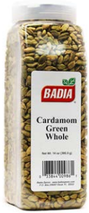
CARDAMOM GREEN WHOLE - 00986 6/14 OZ