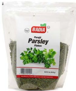
PARSLEY FLAKES - 02122 6/3 OZ