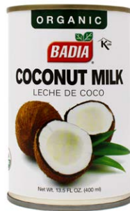
ORGANIC COCONUT MILK - 00555 12/13.5 OZ