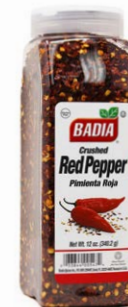
PEPPER RED CRUSHED - 00547 6/12 OZ