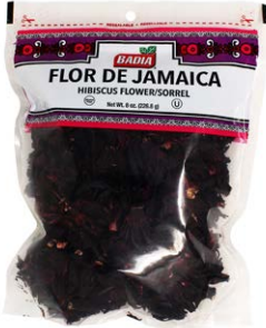
HIBISCUS FLOWER - 00644 12/8 OZ