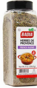
HERBES DE PROVENCE - 00803 6/8 OZ