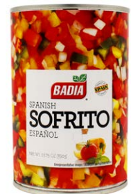
SPANISH SOFRITO - 00455 12/14.1 OZ