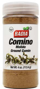
CUMIN GROUND - 63004 6/4 OZ