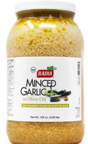
MINCED GARLIC IN OLIVE OIL - 00423 4/128 OZ