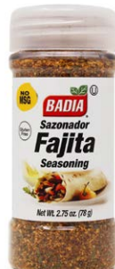
FAJITA SEASONING - 80634 8/2.75 OZ