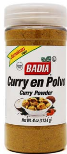
CURRY POWDER - 63007 6/4 OZ