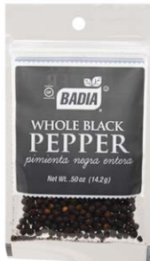
PEPPER WHOLE BLACK - 00025 12/0.5 OZ