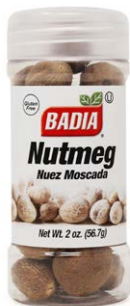
NUTMEG WHOLE - 80750 8/2 OZ

The one that started it all, has the perfect combination of ingredients and spices, carefully chosen to enhance the natural flavor of your favorite food.