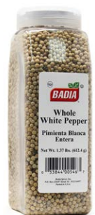
PEPPER WHITE WHOLE - 00546 6/1.37 LBS