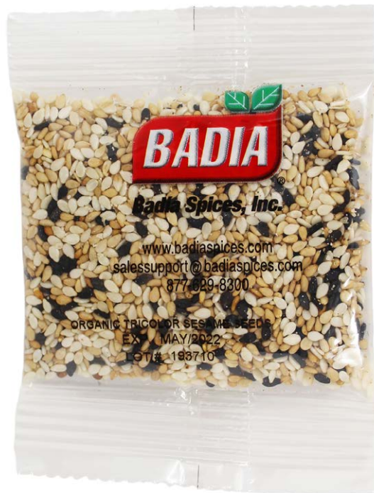
ORGANIC TRI-COLOR SESAME SEEDS

Find below a selected list of items part of our Portion Control line of service. These perfect and convenient small bags are a great packaging vehicle for take-out spices.