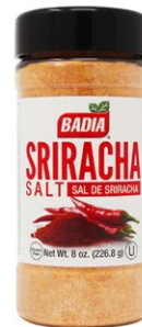
SRIRACHA SALT - 60151