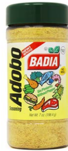
ADOBO WITHOUT PEPPER - 60401 6/7 OZ