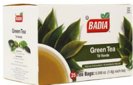
GREEN TEA - 00638 10/25 BAGS