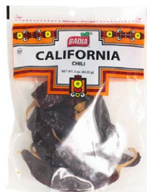
CALIFORNIA - 00642 12/3 OZ