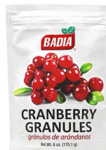
CRANBERRY GRANULES - 02127 8/6 OZ