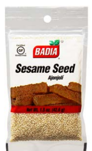
SESAME SEED HULLED - 00065 12/1.5 OZ