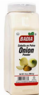
ONION POWDER - 00636 6/14 OZ