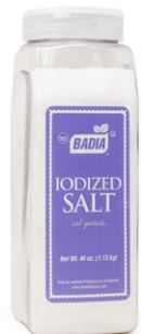
SALT IODIZED - 40508 4/40 OZ