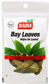
BAY LEAVES WHOLE - 00019 12/0.2 OZ