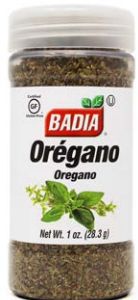
OREGANO - 63009 6/1 OZ