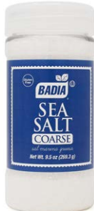
SEA SALT COARSE - 60434 6/9.5 OZ