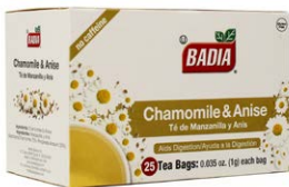
CHAMOMILE & ANISE - 00793 10/25 BAGS