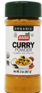
CURRY POWDER - 80170 8/2 OZ