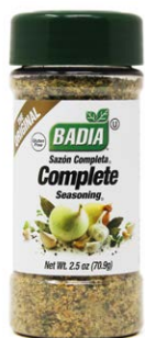
COMPLETE SEASONING® - 00128 12/2.5 OZ

These jars are packed with flavor! From basics for every day in the kitchen, to incredible flavorful blends.