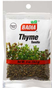
THYME LEAVES - 00209 12/0.5 OZ