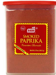
SMOKED PAPRIKA - 00400 12/3.75 OZ