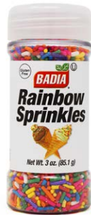
RAINBOW SPRINKLES - 80176 8/3 OZ