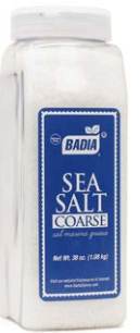
SALT SEA COARSE - 00840 6/38 OZ