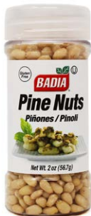
PINE NUTS - 80733 8/2 OZ