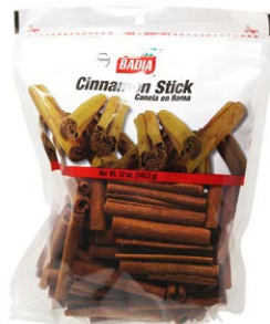
CINNAMON STICKS - 60302 6/12 OZ