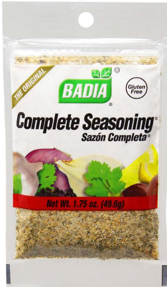
COMPLETE SEASONING® - 00099

This convenient and resealable size is the perfect one for the everyday needs while keeping the product fresh.