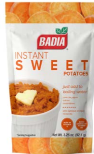
INSTANT SWEET POTATOES - 01267 6/3.25 OZ