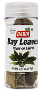
BAY LEAVES WHOLE - 80208 8/0.17 OZ