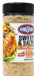
SWEET & SALTY - 66006 6/6.5 OZ