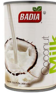
COCONUT MILK - 12261 12/13.5 OZ