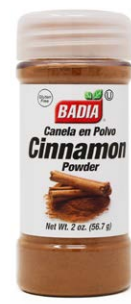
CINNAMON POWDER - 80015 8/2 OZ