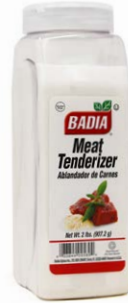
MEAT TENDERIZER - 00589 6/2 LBS