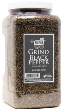
PEPPER BLACK TABLEGRIND - 00813 4/4 LBS