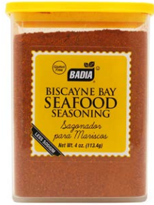
BISCAYNE BAY SEASONING - 00397 12/4 OZ