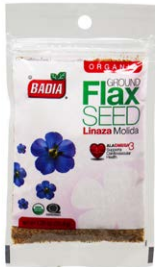
ORGANIC FLAX SEED GROUND - 00043 12/1.25 OZ