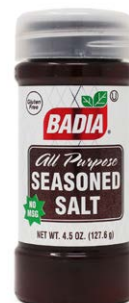
SEASONED SALT - 80228 8/4.5 OZ